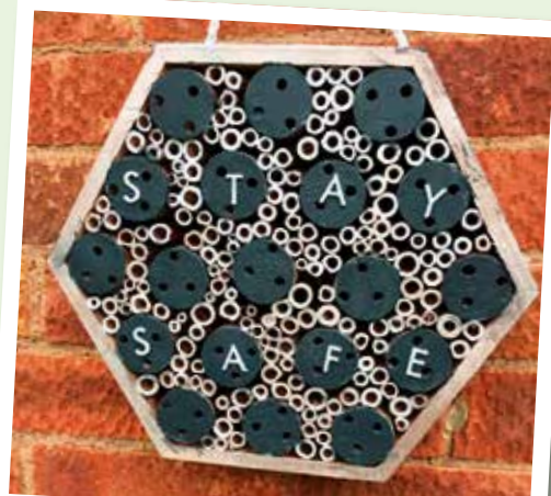
Jorgia Downing (Y8) – STEM project. Bug Hotel with a fantastic message.